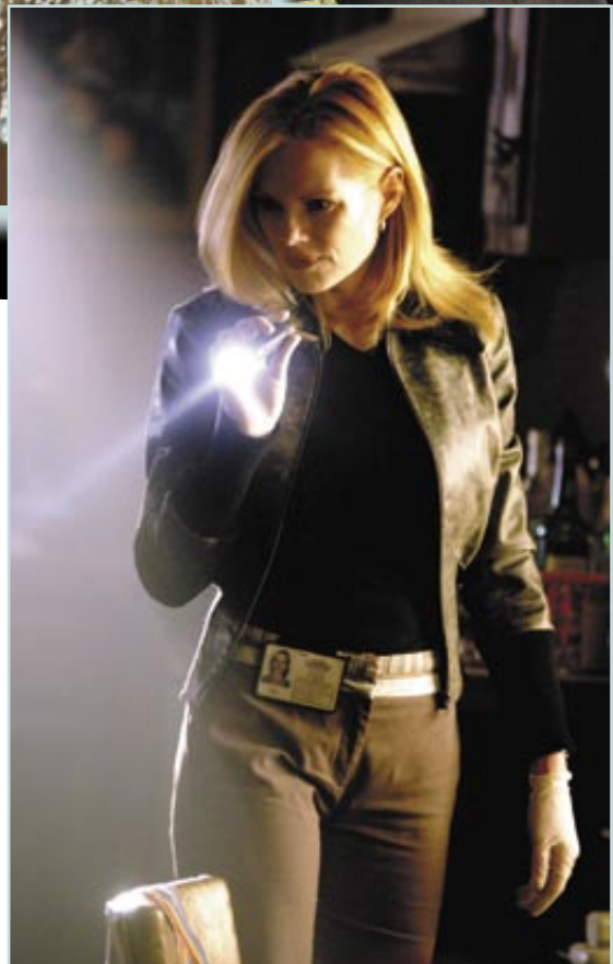
CSI MULTITASKER Catherine Willows combines roles of real-life investigators.